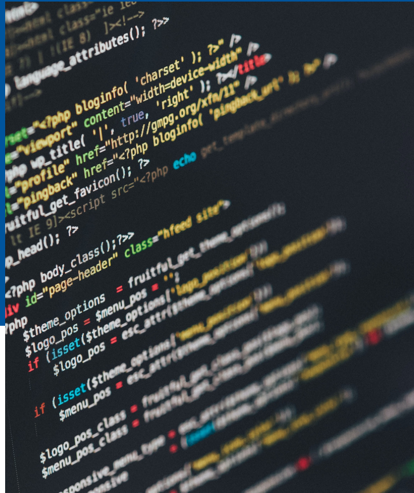
IT HUB's first year