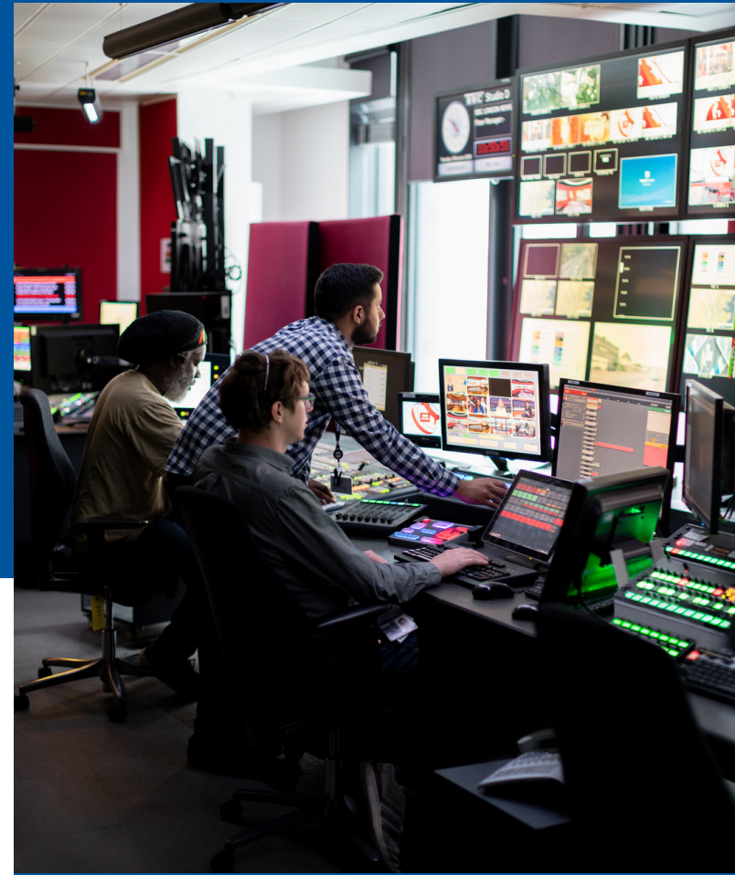
IT HUB Eurasia