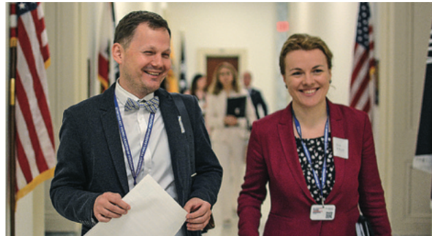
Vice Minister of Environment of the Republic of Lithuania Martynas Norbutas and State Secretary of the Ministry of Foreign Affairs and European Integration of the Republic of Moldova Tatiana Molcean on their way to one of their engaging Hill meetings where they learned about the ins-and-outs of the U.S. government.