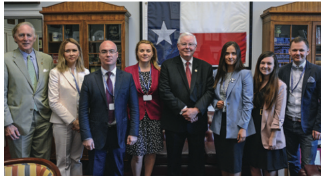
Congressman Joe Barton (R-TX) and President of the U.S. Association of Former Members of Congress, former Congressman Cliff Stearns taking a group photo after a lively discussion with the StrategEast Young Leadership Program 2018 delegation.