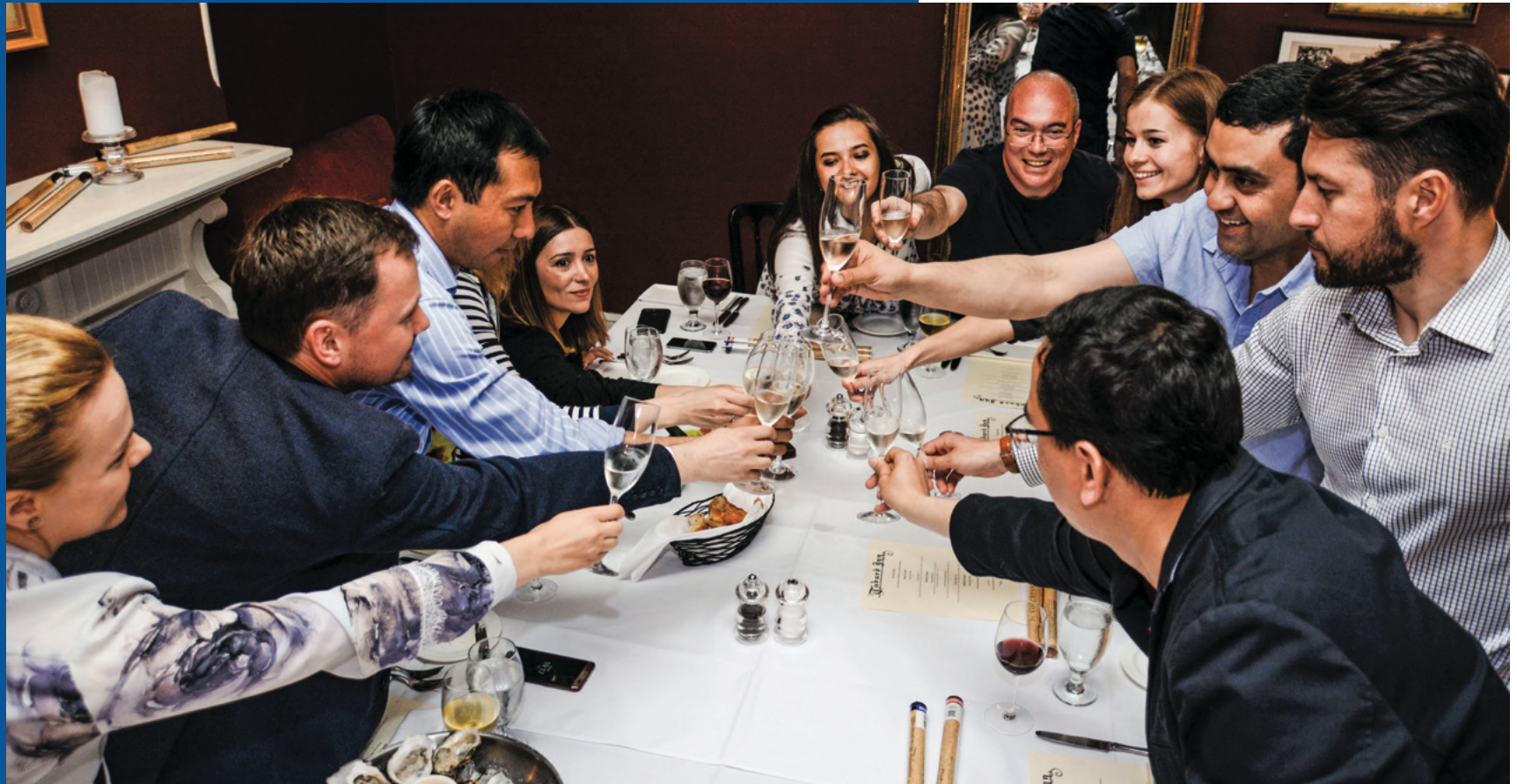
StrategEast Young Leadership Program 2018 participants raising their glasses of sparkling wine and water during the final dinner discussion on the obtained knowledge and the planning of future cooperation.