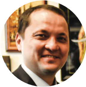
Timur Toktabayev Deputy Minister of Investment and Development of Kazakhstan