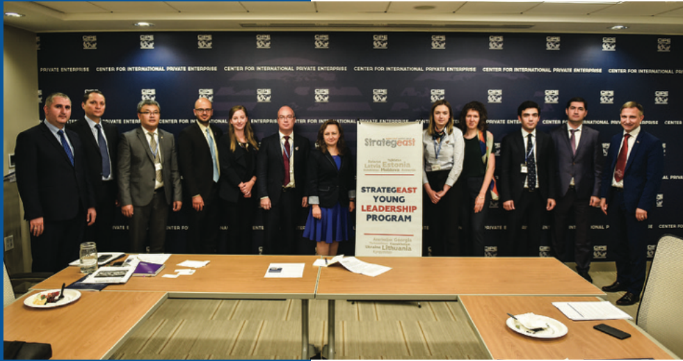
Meeting at Center for International Private Enterprise