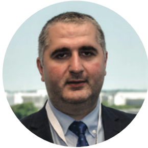
Lasha Khutsishvili Deputy Minister of Finance of Georgia