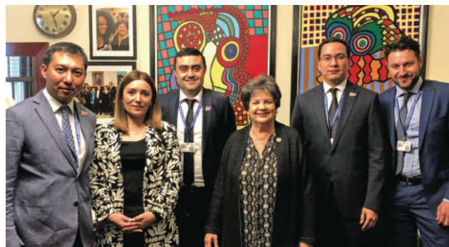
Congresswoman Lois Frankel (D-FL) taking a group photo with the StrategEast Young Leadership Program 2018 delegates in her office at the U.S. Capitol.