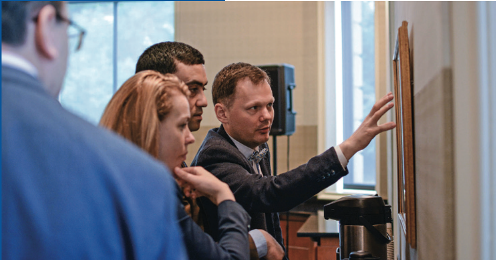
StrategEast Young Leadership Program 2018 participants at a Lunch Panel on the Western expectations with respect to economic engagement, trade and investment at the German Marshall Fund of the United States.