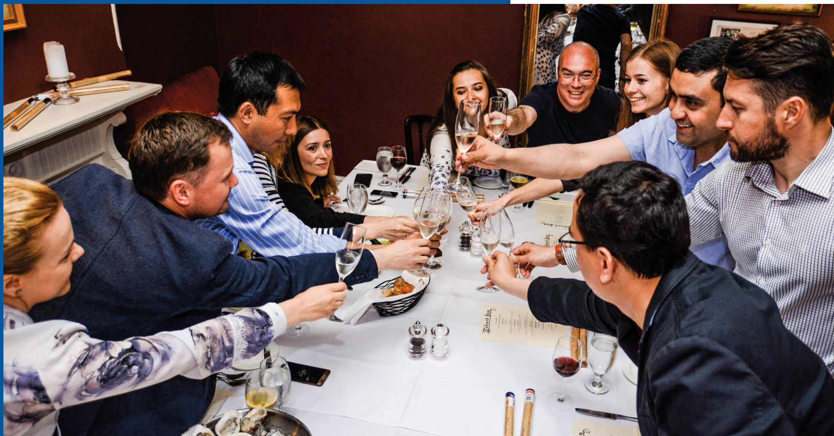
StrategEast Young Leadership Program 2018 participants raising their glasses of sparkling wine and water during the final dinner discussion on the obtained knowledge and the planning of future cooperation.