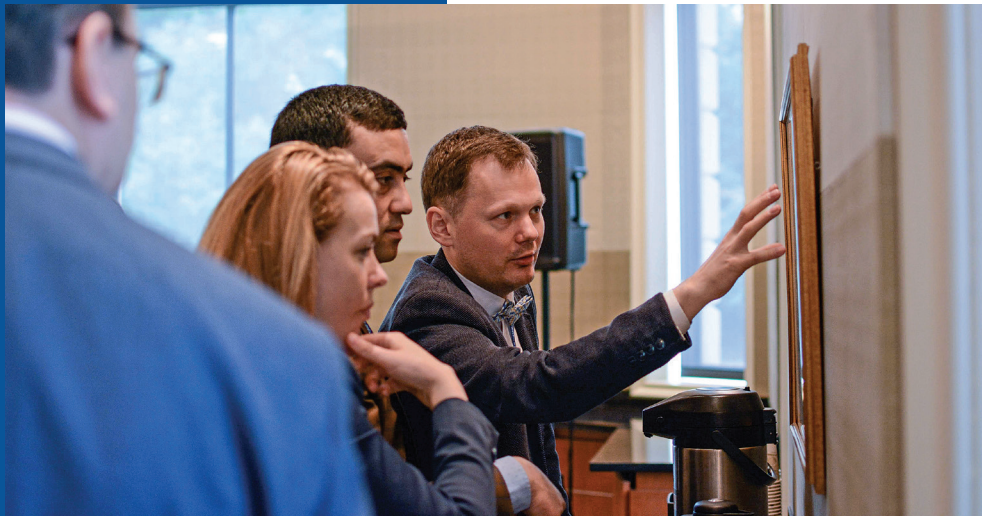
StrategEast Young Leadership Program 2018 participants at a Lunch Panel on the Western expectations with respect to economic engagement, trade and investment at the German Marshall Fund of the United States.