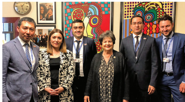
Congresswoman Lois Frankel (D-FL) taking a group photo with the StrategEast Young Leadership Program 2018 delegates in her office at the U.S. Capitol.