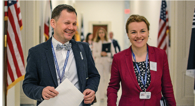
Vice Minister of Environment of the Republic of Lithuania Martynas Norbutas and State Secretary of the Ministry of Foreign Affairs and European Integration of the Republic of Moldova Tatiana Molcean on their way to one of their engaging Hill meetings where they learned about the ins-and-outs of the U.S. government.