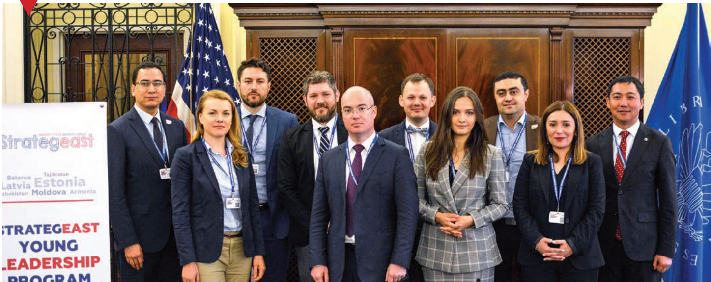
StrategEast Young Leadership Program 2018 delegation at the Thomas Jefferson Building, Library of Congress, Washington, D.C.

English speaking deputy ministers under the age of 40, representing their home governments of Belarus, Georgia, Kazakhstan, Kyrgyzstan, Lithuania, Moldova, Tajikistan, Ukraine, and Uzbekistan. A crucial part of the program was acquiring new knowledge and exchanging information about reforms and state management not just between the host and the participants, but also among the deputy ministers.