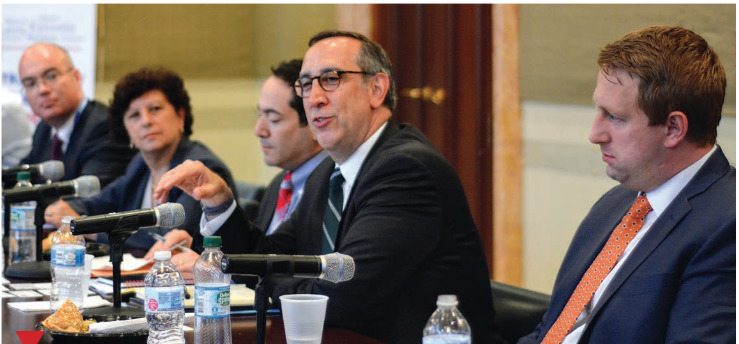
Panel Discussion on the Western expectations with respect to economic engagement, trade, and investment at the German Marshall Fund of the United States.