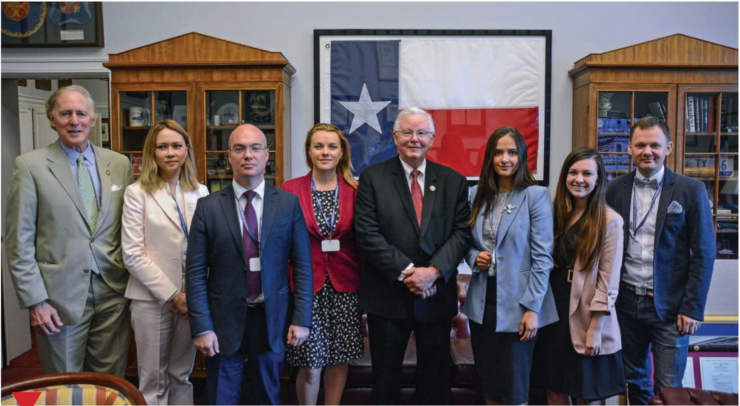
Congressman Joe Barton (R-TX) and President of the U.S. Association of Former Members of Congress, former Congressman Cliff Stearns taking a group photo after an avid discussion with the StrategEast Young Leadership Program 2018 delegation.