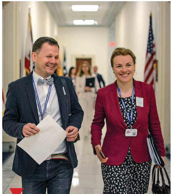
Vice Minister of Environment of the Republic of Lithuania Martynas Norbutas and State Secretary of the Ministry of Foreign Affairs and European Integration of the Republic of Moldova Tatiana Molcean on their way to one of their engaging Hill meetings, where they learned about the ins-and-outs of the U.S. government.