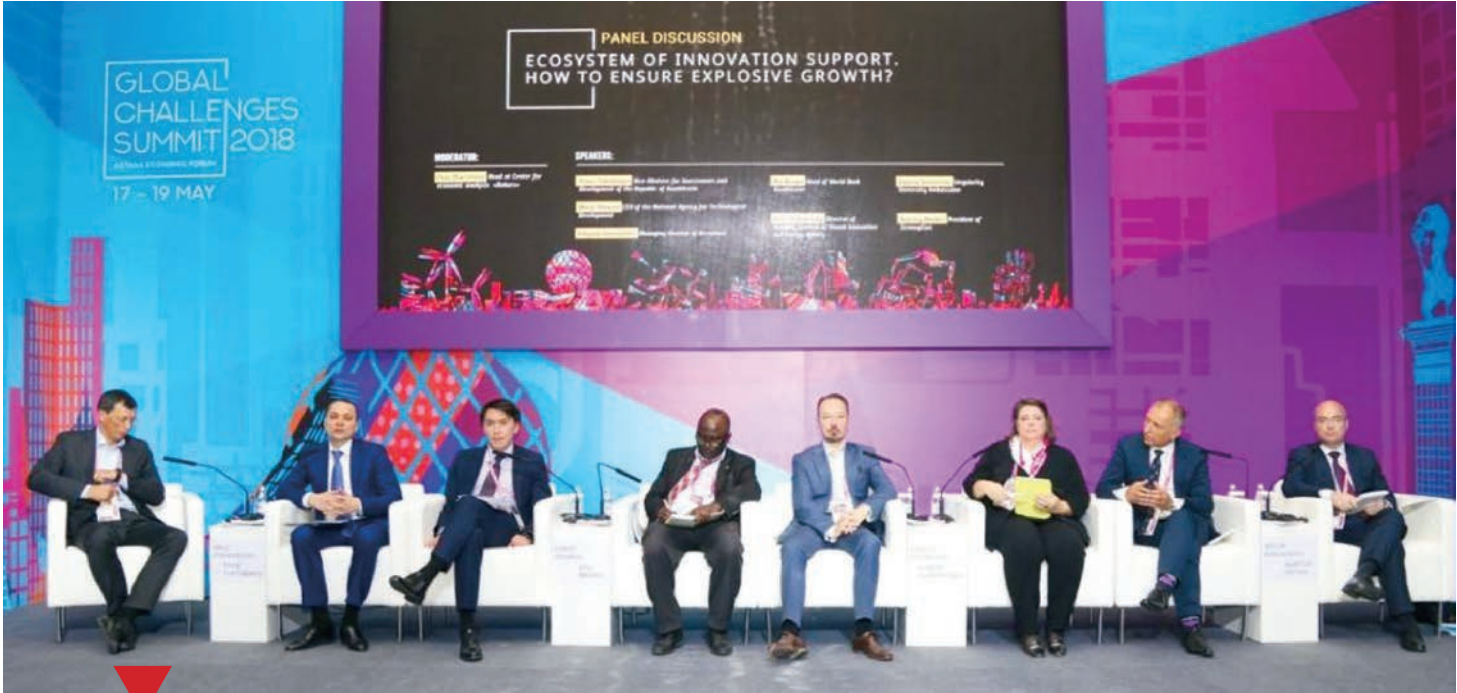
Panel Discussion “Ecosystem of Innovation Support. How to Ensure Explosive Growth” at the Astana Economic Forum’s Global Challenges Summit 2018 (May 17-19, 2018)

In late May of 2018, the “Changing Economy, Changing Society” report and the “Global Minds Initiative” program were presented in another Central Asian country – Uzbekistan. The StrategEast delegation paid a working visit to Uzbekistan, with the goal of presenting the report