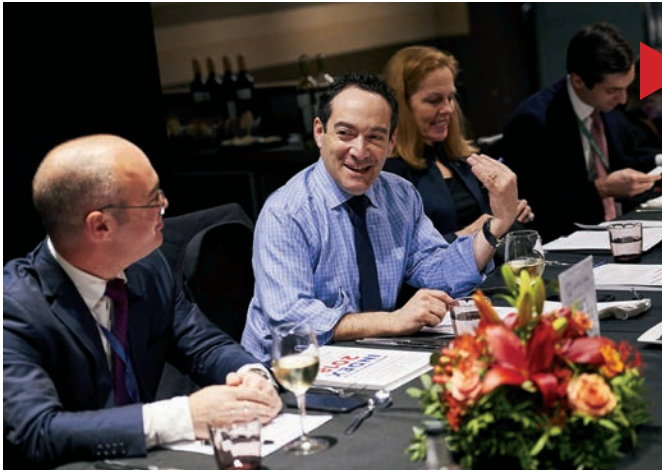
Panel discussion dedicated to the launch of the StrategEast Westernization Index at the German Marshall Fund's Brussels Forum, March 9, 2018