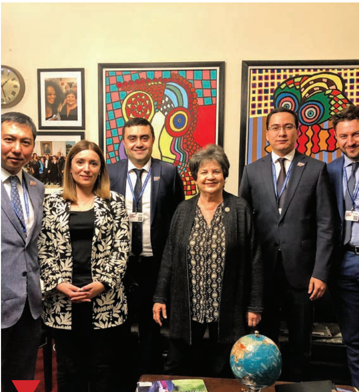
Congresswoman Lois Frankel (D-FL) taking a group photo with the StrategEast Young Leadership Program 2018 delegates in her office at the U.S. Capitol.