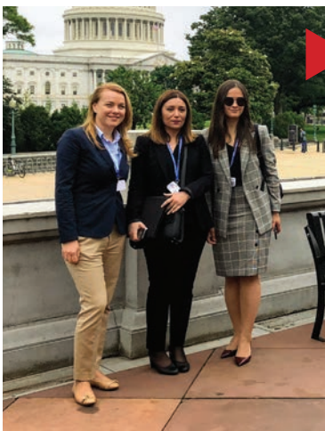
StrategEast Young Leadership Program 2018 participants posing together in front of the U.S. Capitol between meetings and enjoying the views of Washington, D.C. Left to right: State Secretary of the Ministry of Foreign Affairs and European Integration of the Republic of Moldova Tatiana Molcean, Deputy Minister of Environmental Protection and Agriculture of Georgia Nino Tandilashvili, and Deputy Minister of Energy and Coal Industry on European Integration of Ukraine Nataliya Boyko.