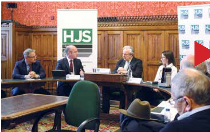
Presentation of the StrategEast Westernization Report 2019 at the British Parliament. London (UK), February 28, 2019.