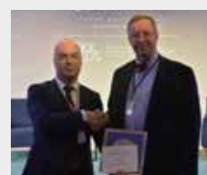
Lifetime Achievement - Toomas Hendrik Ilves, President of Estonia (2006–2016)