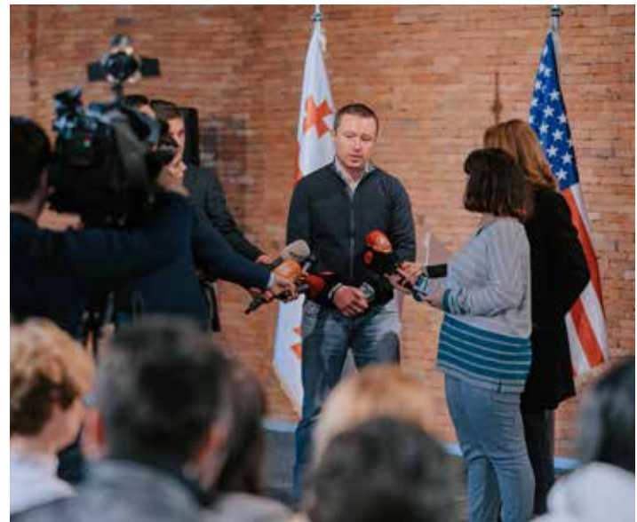
Irakli Nadareishvili, Deputy Minister of Economy and Sustainable Development of Georgia

Each IT HUB student has a personal instructor from EPAM Systems. The online training format in the IT HUB allows the educational center to work even during lockdown. Georgian students can not only acquire one of the IT specialties remotely, but also find their first job without leaving home.