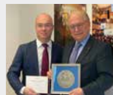
Political Westernization - Ambassador Wolfgang Ischinger, Chairman of the Munich Security Conference