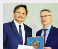
Language and Culture Westernization - Erden Kazhybek, Head of the Institute of Linguistics in Kazakhstan, one of the main developers of the Latin-Kazakh alphabet