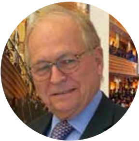
Ambassador Wolfgang Ischinger, Chairman of the Munich Security Conference

The second edition shows trends in political, economic, and legal Westernization, and by extension, the effectiveness of efforts by Western institutions operating in the region.