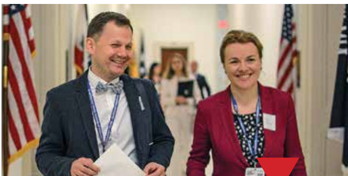
Vice Minister of Environment of the Republic of Lithuania Martynas Norbutas and State Secretary of the Ministry of Foreign Affairs and European Integration of the Republic of Moldova Tatiana Molcean on their way to one of their engaging Hill meetings where they learned about the ins-and-outs of the U.S. government.