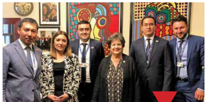
Congresswoman Lois Frankel (D-FL) taking a group photo with the StrategEast Young Leadership Program 2018 delegates in her office at the U.S. Capitol.