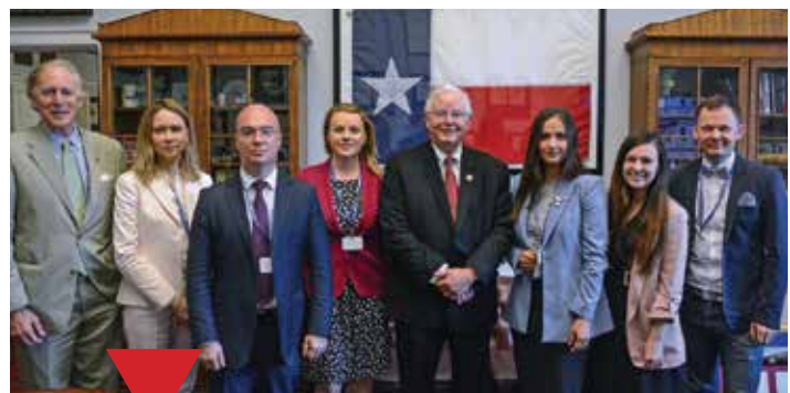
Congressman Joe Barton (R-TX) and President of the U.S. Association of Former Members of Congress, former Congressman Cliff Stearns taking a group photo after a lively discussion with the StrategEast Young Leadership Program 2018 delegation.